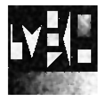
Figure 7 Method of Chu et al.