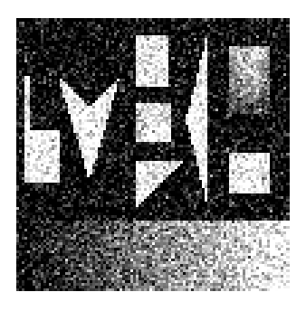
Figure 6. Noisy Image